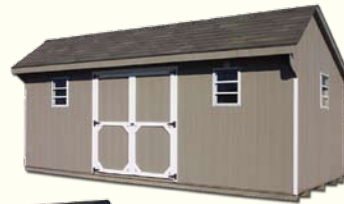
12x20 Clay Quaker with Weathered Wood Roof