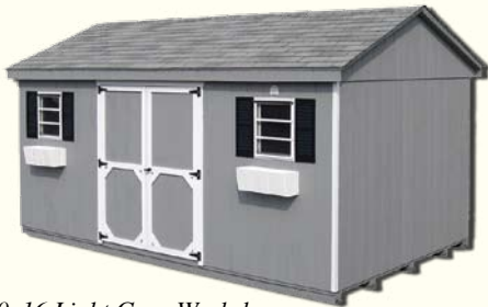
10x16 Light Gray Workshop Granite Gray roof with optional Shutters & Flower Boxes

The Workshop style is available in all sizes. Two windows and 1/2" residential wood siding are standard. Vinyl Siding is 30% extra.