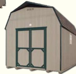
12x24 Clay Highwall Barn with Hunter Green Trim & Weathered Wood Roof