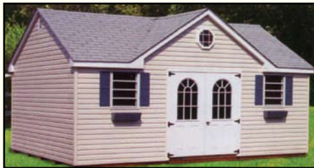
Custom designed to match your home.

Here are just a few of the upgrades and options you can select: