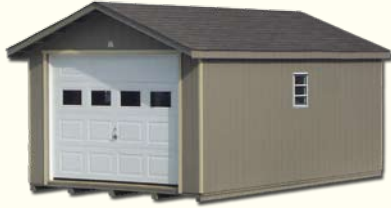
12x24 Shed with optional overhead door

Workshop can be used as a single car garage. Overhead door additional cost. Insulated garage doors available.