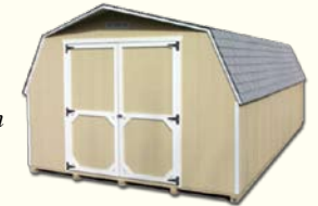
12x24 Beige Mini Barn with White Roof