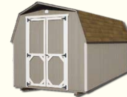
8x10 Clay Mini Barn with Beige Trim