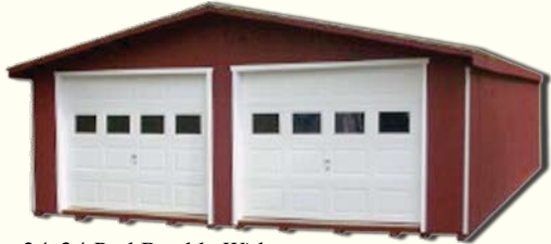
24x24 Red Double Wide