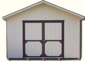
14x24 with doors on gable end