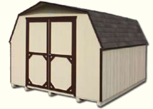
10x14 Tan Mini Barn

Our barns and custom designed storage sheds are long lasting, rugged, maintenance free, good looking, and easily movable. We will build storage and special purpose buildings in many stock sizes and custom designs. Stock designs include one aluminum awning window. To preserve your shed we recommend rain gutters.