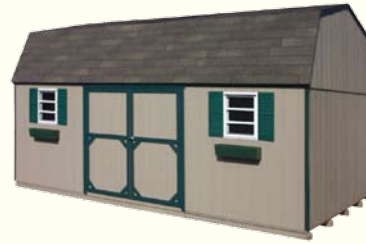
12x20 Clay Highwall Barn with optional Hunter Green Shutters and Flower Boxes